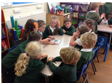
Health and Safety Leadership Team