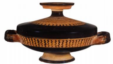
A lekane was a bowl with a lid, used for storing jewellery, trinkets and cosmetics.