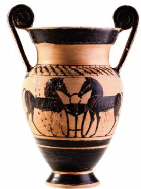
A volute krater had curved handles.