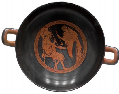
A kylix was a shallow drinking cup.