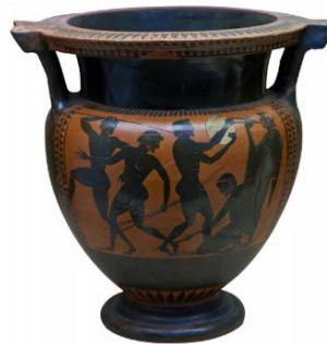
A krater was used to mix water with wine.