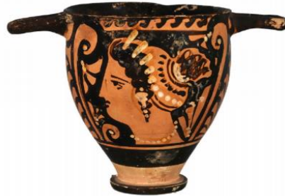
A skyphos was a cup used to drink wine.