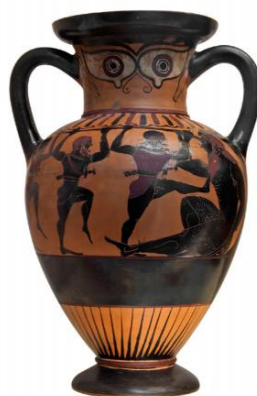
An amphora was used to store liquids and solids.