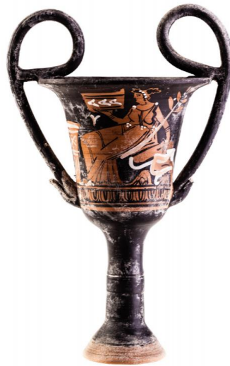
A kantharos was a drinking cup with tall handles.