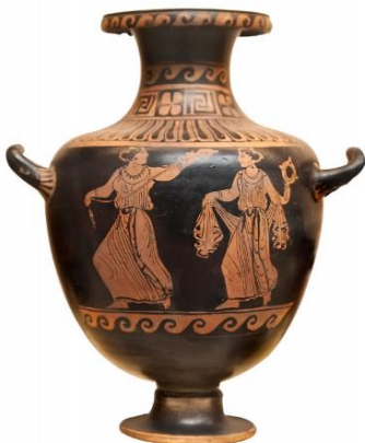
A hydria was used to carry water.