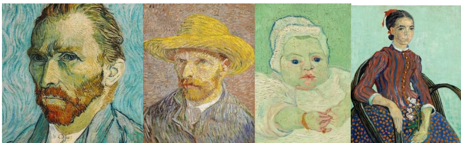
Vincent Van Gogh