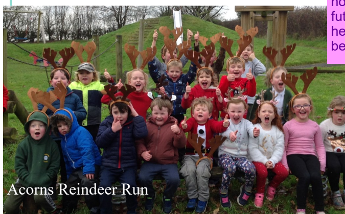
Acorns Reindeer Run