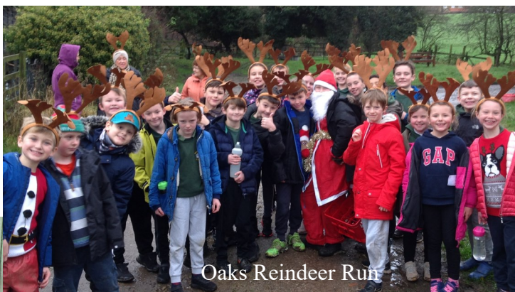
Oaks Reindeer Run