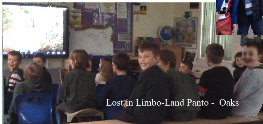
Lost in Limbo-Land Panto - Oaks